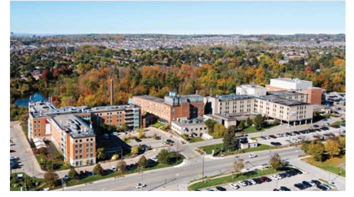
Mackenzie Richmond Hill Hospital

The opening of Cortellucci Vaughan Hospital added significant health care capacity to York Region. As one of Canada's fastest growing communities, the number of people living in York Region is expected to increase by more than 35 per cent over the next 20 years. But until last year, Mackenzie Richmond Hill Hospital was the only hospital serving western York Region — and was consistently ranked as one of the most overcapacity hospitals in Ontario.