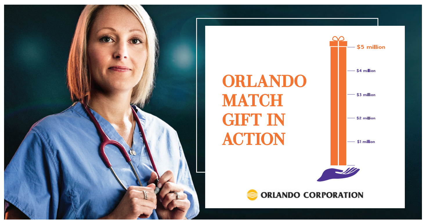
Orlando Corporation is doubling our donor's efforts. These funds empower our health care staff with innovative technology,